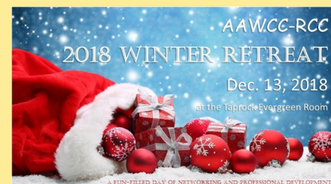
AAWCC-RCC Winter Retreat Announcement