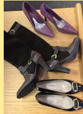
AAWCC-RCC Spring Clothing Sale

This year, we awarded two scholarships for $1,000 each. We post our scholarship recipients thank you letters on our website.