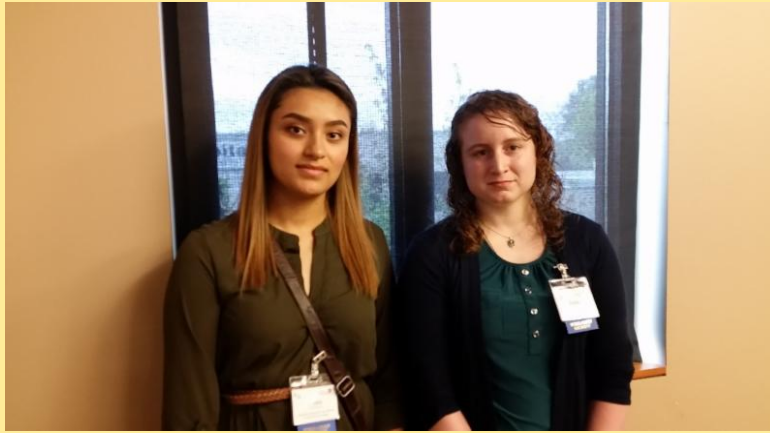
Chemeketa Scholarship Recipients