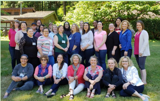
2018 OILD Leaders

Twenty-two women from Oregon community colleges attended the 27th annual Oregon Institute for Leadership Development (OILD) last June at the Silver Falls Conference Center. OILD provides positive leadership development and connected women with community college executives and administrators from all over the state while experiencing the natural beauty of Silver Falls State Park. If you have not attended OILD in the past, be sure to look for the application process at your college next year. Applications are due to AAWCC-Oregon in April.