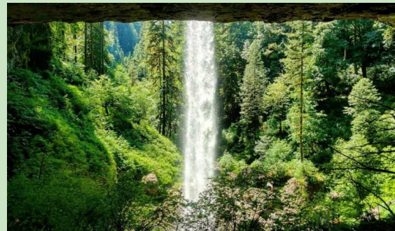
Under the waterfall at Silver Falls