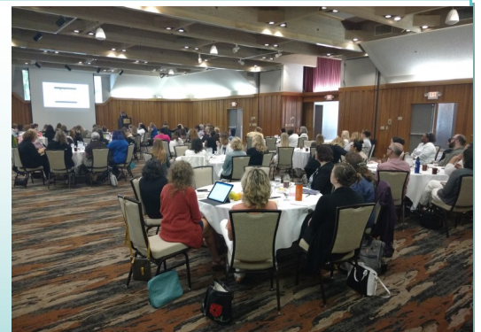
Participants focus on keynote speaker at Summer Conference 2017