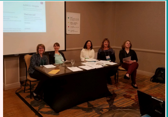
Mentorship workshop at Fall Conference 2017

The inaugural group of participants from five community colleges including Rogue, Clackamas, Mt. Hood, Lane and Chemeketa began meeting in January. Participants, paired with AAWCC members from another community college, are mid-way through the six-month pilot program. At a recent check-in, the mentorship committee was interested to hear from participants about how mentorship has shaped their views, career paths, expanded their self-awareness and knowledge of community colleges and their work. A guidebook was developed as a tool to help steer conversations as needed. Mentees and mentors will share their experiences as a