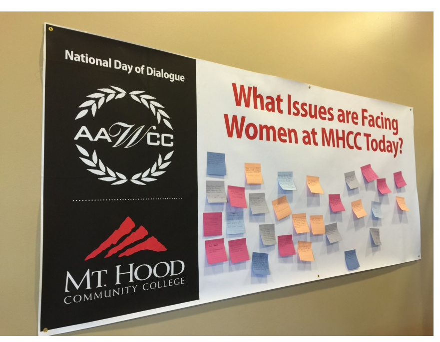
Mt. Hood Community College's chapter was one of many around the nation who discussed issues facing women today

membership registration, and plan to share the passionate responses and keep the conversation going campus-wide.