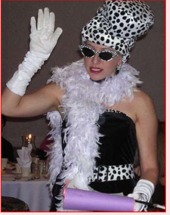
Join the fun

A murder mystery dinner theater was just part of the fun fall conference attendees enjoyed in 2005. Be sure to book your place for the 2006 conference, Nov. 16-17.