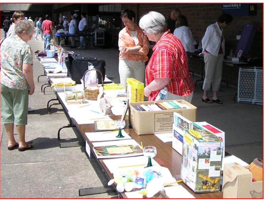
The Linn-Benton Comunity College silent auction raised more than $1,000 in three hours for scholarships

We're excited as usual about what's going on at Mt. Hood Community College. We have a full calendar this year with retreats, general membership breakfast meetings, brown bag lunch sessions, and professional development workshops. In