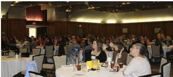
2016 Summer Conference attendees

Once again, the AAWCC Summer Conference was held at the beautiful Salishan Lodge and Resort in Gleneden Beach. Over one hundred community college women came together to gain knowledge of how to communicate effectively in a variety of settings.